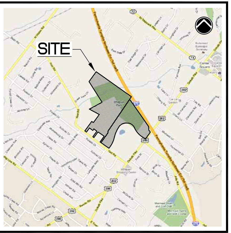
SITE LOCATION MAP 1" = 2,000'