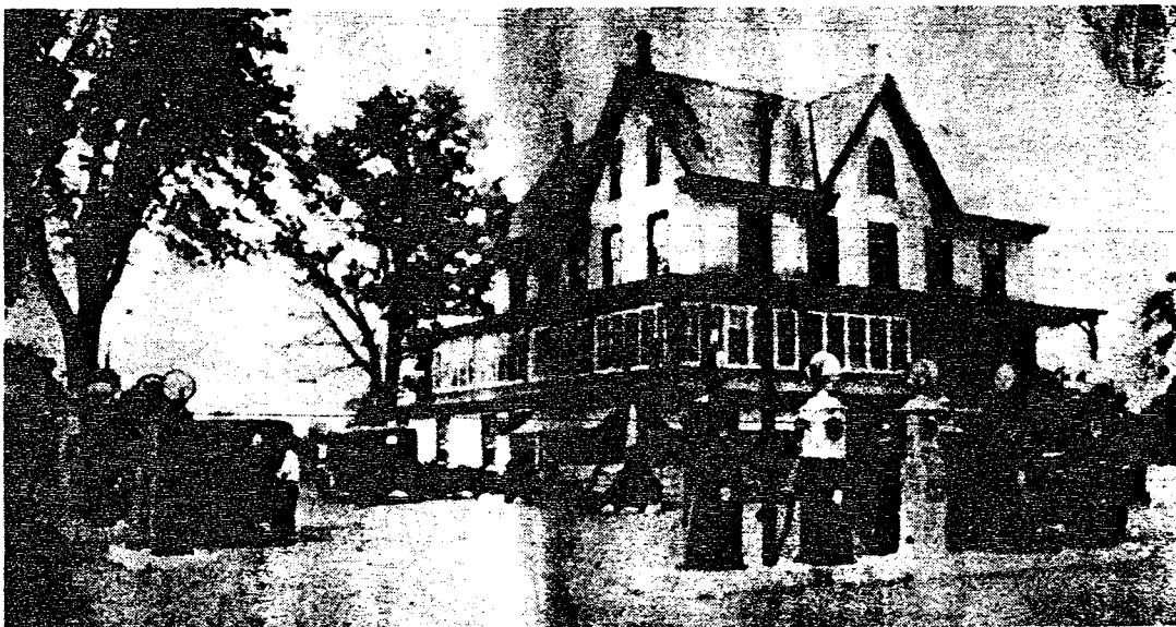
Bernhard Store and Centre Square Post Office