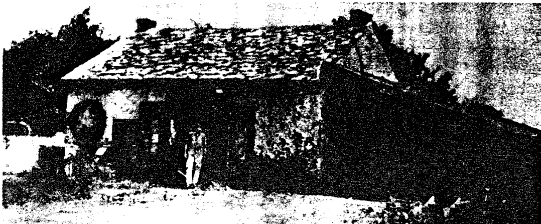
Blacksmith Shop Centre Square