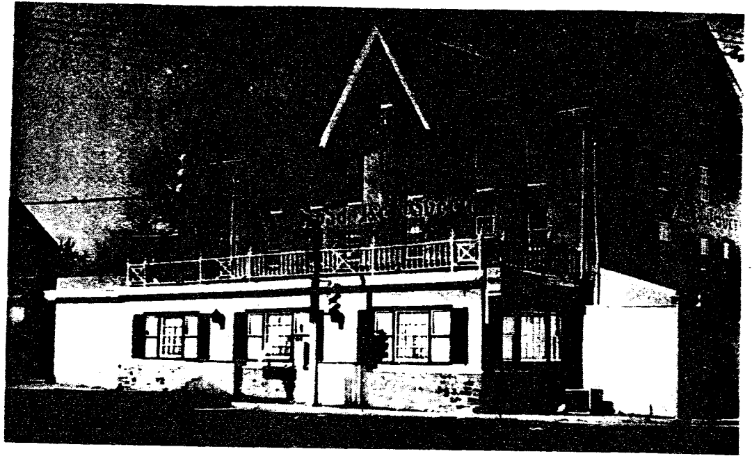
"Broad Axe Tavern" — 1977