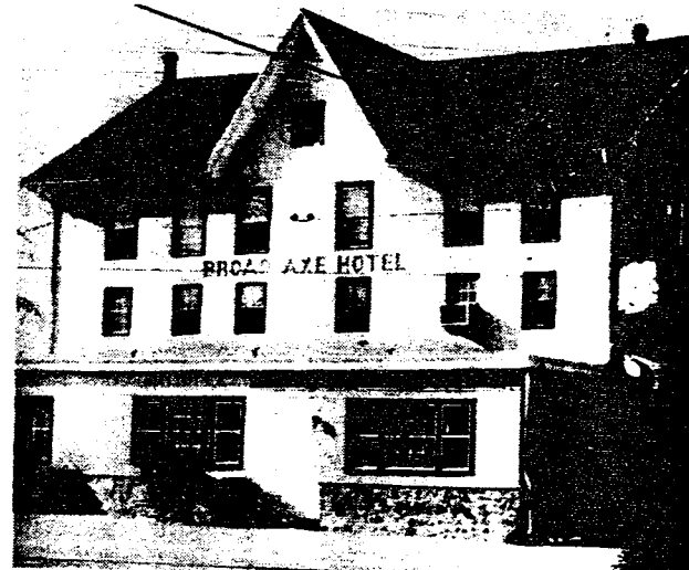
"Broad Axe Hotel" — 1960